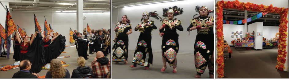
From left to right: A new Thursday evening event included performances by the North High School Marching Band and Ballet Folklorico Estrallas de Jalisco. Hundreds of marigolds were created by the community and local schools for the Museum's Día de los Muertos archway to the altar display.

This year's theme, Creciendo Nuestras Raíces (Growing Our Roots), focused on the indigenous elements of the Mexican Day of the Dead. The marigold flower, or the Flower of the Dead, takes its name from Nahuatl, the Aztec language. Marigolds are frequently placed on altars in the belief that fragrance attracts the spirits of the dead. Often found within homes or public