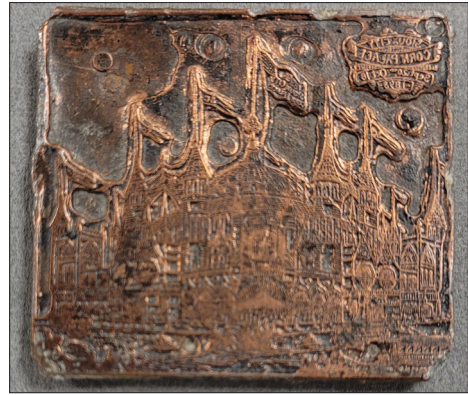
Found on a Nebraska farm, this printing block depicts the proposed 1893 Corn Palace. Due to the Floyd River Flood of 1892 and the 1893 Financial Panic, the era of Corn Palaces in Sioux City ended after 1891.