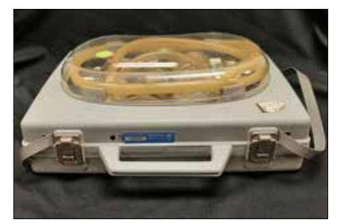
A 1969 portable aspirator used at Marian Health Center.