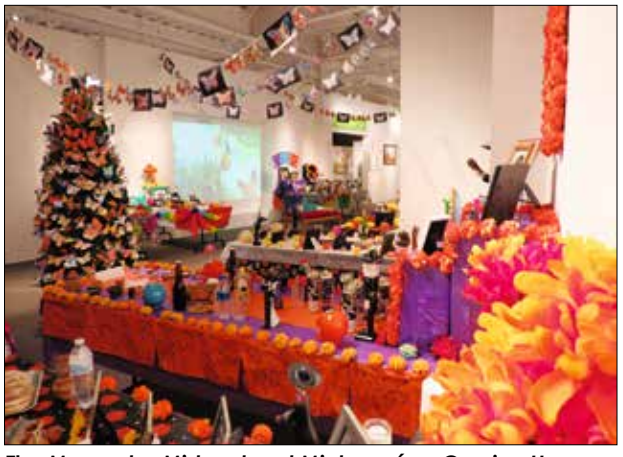
The Monarchs, Midwest and Michoacán – Coming Home altar display exhibit featured a pine-tree habitat with monarchs decorated by local schools and the community.

Offered in both English and Spanish, Día de los Muertos programs began in September to coincide with the migration of the monarch. A program featuring the children's book, "Señorita Mariposa," traced the monarch's great journey through the Midwest and Michoacán. Participants were encouraged to make a monarch to help decorate the altar display exhibition. Along with monarch-making programs, an altar-making