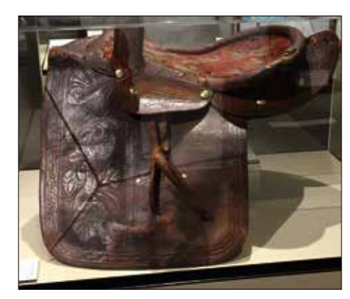
The side saddle used by Carolyn "Tigger" Jensen's grandmother, Florence Slagle, shown in a display case from the New to You: Recent Artifact Donations exhibit.