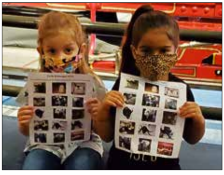
The first fall Kid's Days featured a farmthemed scavenger hunt in September 2020.

Museum staff also continued to reach school groups by presenting 25 virtual tours and presentations to K-12 students during FY21, totaling