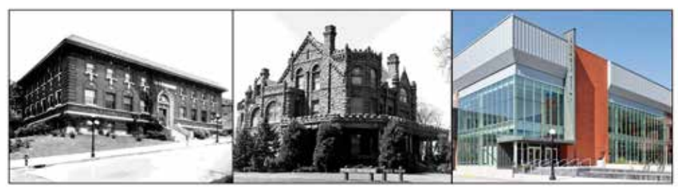
Three of the museum sites throughout the years — the Carnegie Library, Peirce Mansion, and the current downtown site — were featured in April's History at High Noon.

May's History at High Noon featured Sioux City hospitals. These presentations along with past programs are available at SiouxCityMuseum. org/history-at-high-noon.