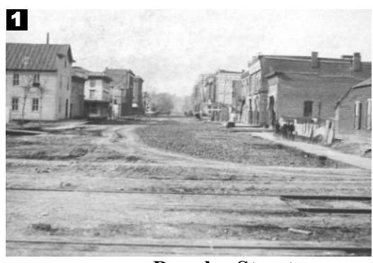
Looking north from Second Street

Start at Second Street and Douglas Street walking north to 7<sup>th</sup> Street.