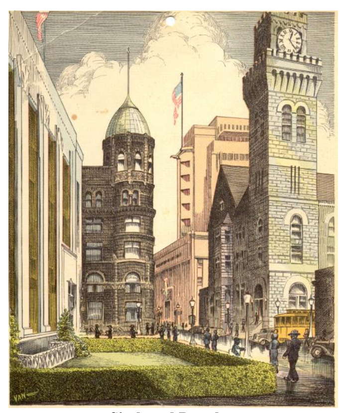
Sixth and Douglas, 1940s