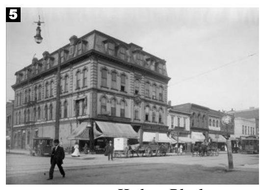
Northeast corner of 4<sup>th</sup> and Douglas