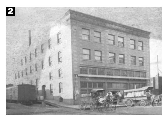
Westside of Douglas between 2<sup>nd</sup> and 3<sup>rd</sup> Streets

Along with Pearl Street, Douglas Street was one of Sioux City's main business streets in the city's first quarter century. There were blacksmith shops, banks, grocers, and hotels along Douglas Street in the 1870s when this photo was taken.