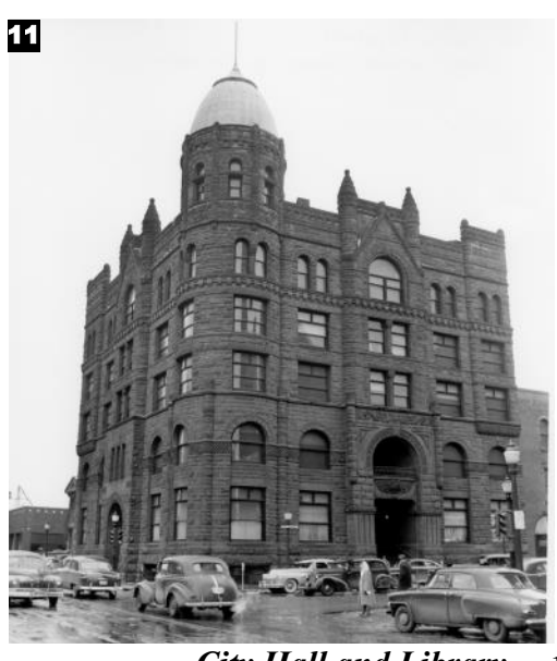
Post Office and Federal Building, c. 1934 Built in 1933 as the Post Office and Federal Building, the Post Office moved out in 1983.

Northwest corner of 6<sup>th</sup> and Douglas