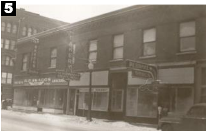
Southwest corner of 4th and Court Streets