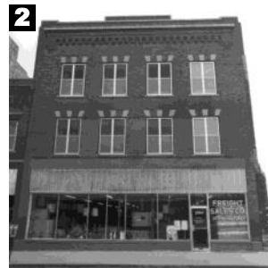
Southwest side of the street