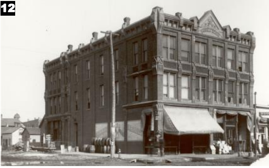
Northeast corner 4 th and Iowa Streets