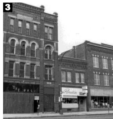
Middle of the south side of the street

This building was constructed around 1905 as a two-story structure. A third story was added sometime after 1919. Morris Levich operated a furniture store at this location from 1908 to 1924. Later it housed a radio store, an auction house, a series of used furniture dealers and the Freight Sales Company. Local artist Paul Chelstad painted the mural on the west side of the building in 2003.