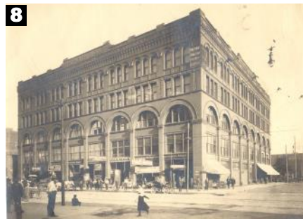
Southeast corner 4th and Court Streets