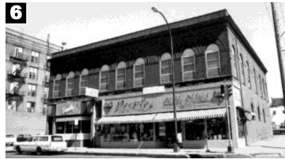
Northwest corner 4th and Court Streets