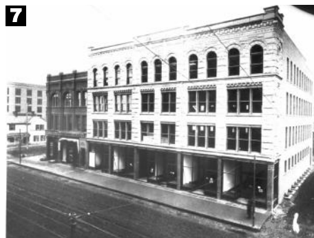
Northeast corner 4th and Court Streets