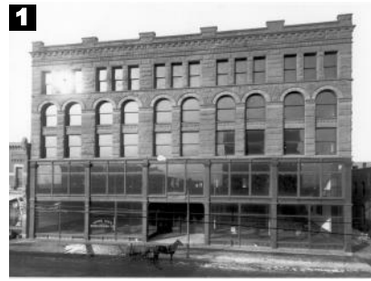
Northwest side of the street

Start the tour at the northwest corner of 4 th and Virginia streets walking east along 4 th Street to Iowa Street.