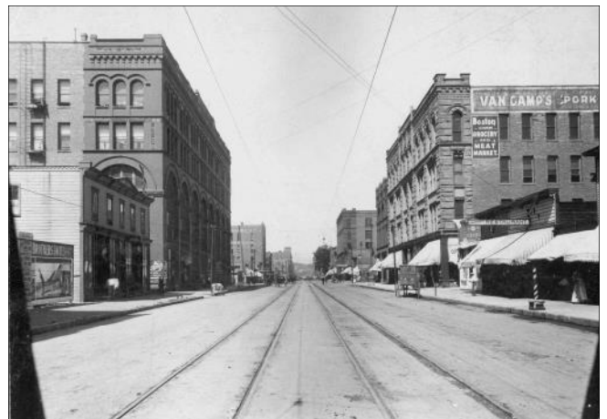
Looking west on 4 th Street from Iowa Street, c. 1898