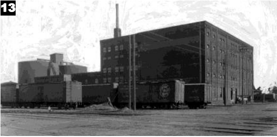
Northeast corner 2 nd and Court Street