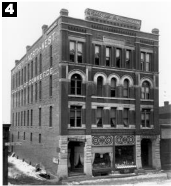
Middle of the south side of the street

Buildings listed in italics are no longer in existence.