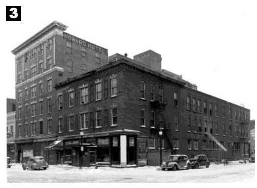
Northeast corner of 3<sup>rd</sup> and Nebraska