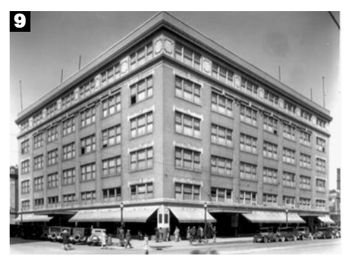
Northeast corner of 4<sup>th</sup> and Nebraska