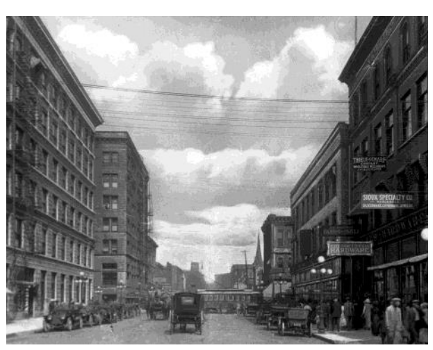
Looking north on Nebraska Street from Third Street, c. 1912